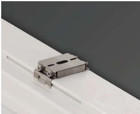
Mounting on the wall or ceiling